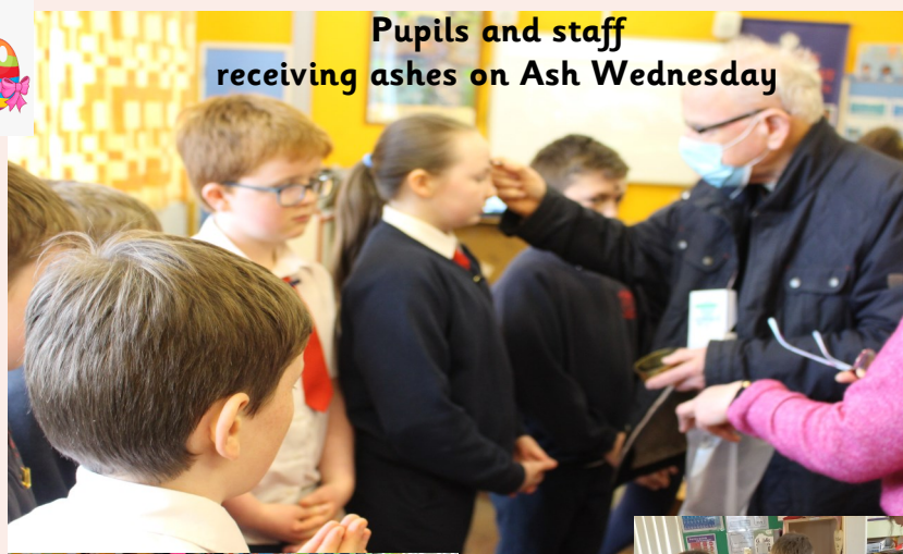
Pupils and staff receiving ashes on Ash Wednesday