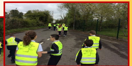
Daily Mile Birthday.

St John the Baptist walk the daily mile about three times a week. We love it!