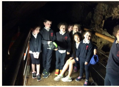
Marble Arch Caves